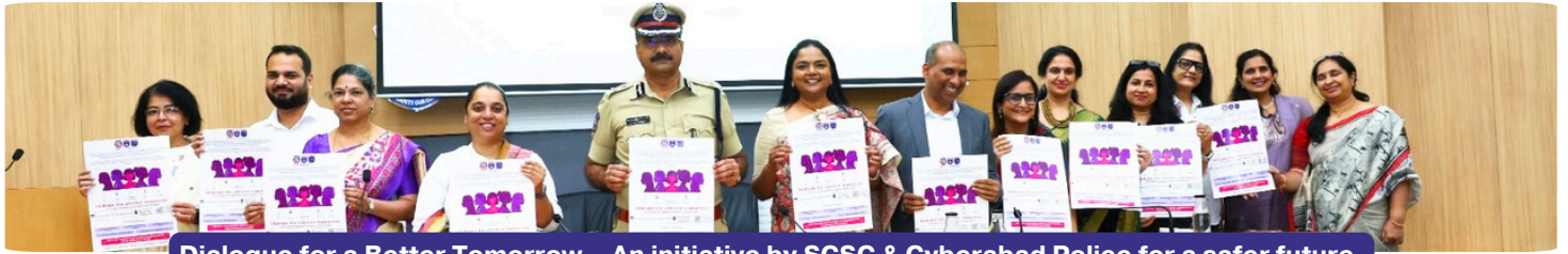
Dialogue for a Better Tomorrow – An initiative by SCSC & Cyberabad Police for a safer future.

Society for Cyberabad Security Council (SCSC) continues to drive impactful initiatives across its women safety, children and youth safety, cyber security, physical Safety, road safety and traffic management, and healthcare forums , empowering communities and building a culture of safety, awareness, and resilience.