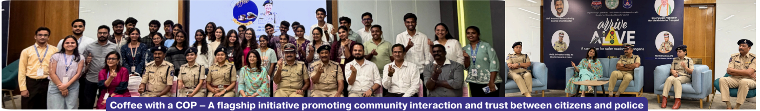
Coffee with a COP – A flagship initiative promoting community interaction and trust between citizens and police

Society for Cyberabad Security Council (SCSC) continues to drive impactful initiatives across its women safety, children and youth safety, cyber security, physical safety, road safety & traffic management, and healthcare forums , empowering communities and building a culture of safety, awareness, and resilience.