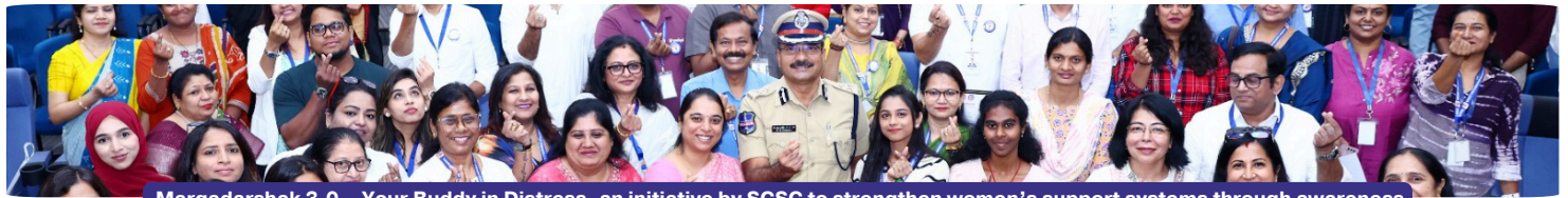
Margadarshak 3.0 – Your Buddy in Distress, an initiative by SCSC to strengthen women’s support systems through awareness